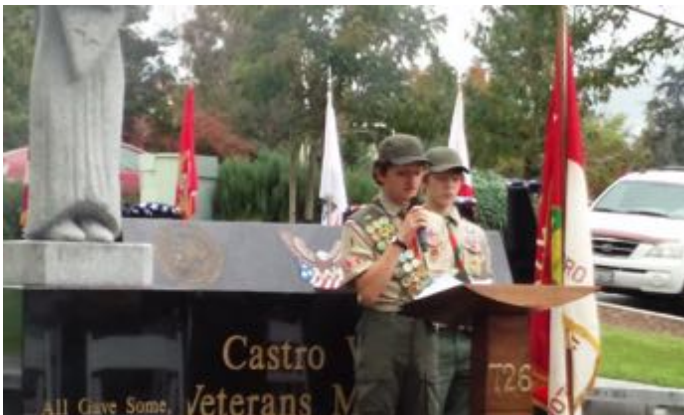
And more from our Senior Patrol leader (left) and our Master of Ceremony (right)