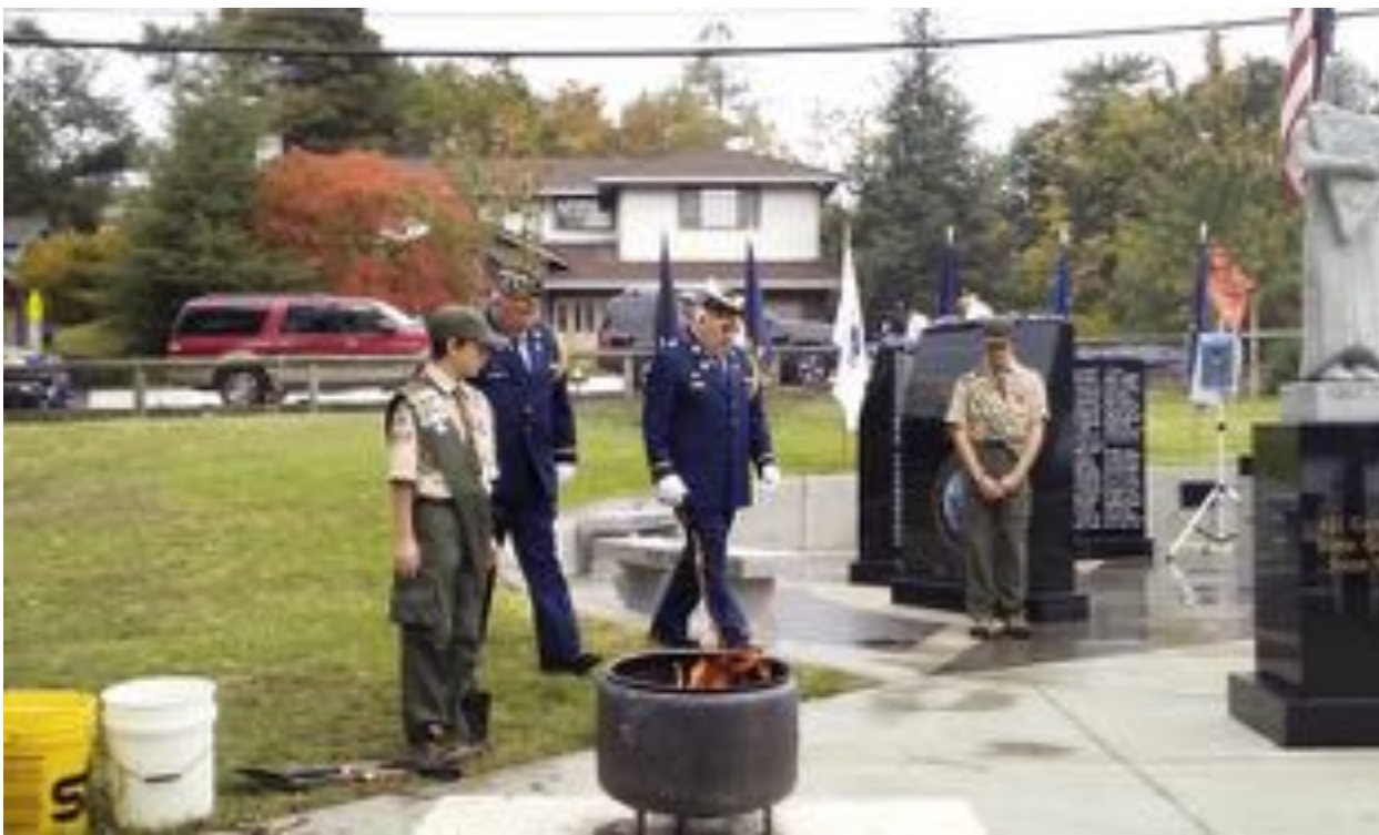
The American Legion presents