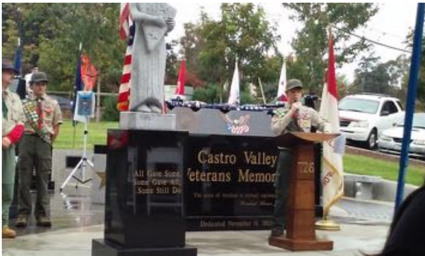
Master of Ceremony- begins