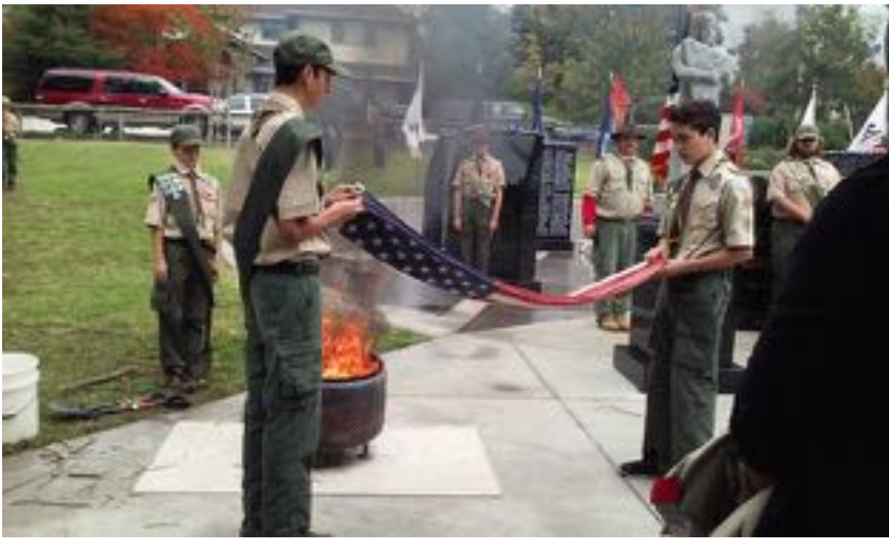
The flag is prepared and presented