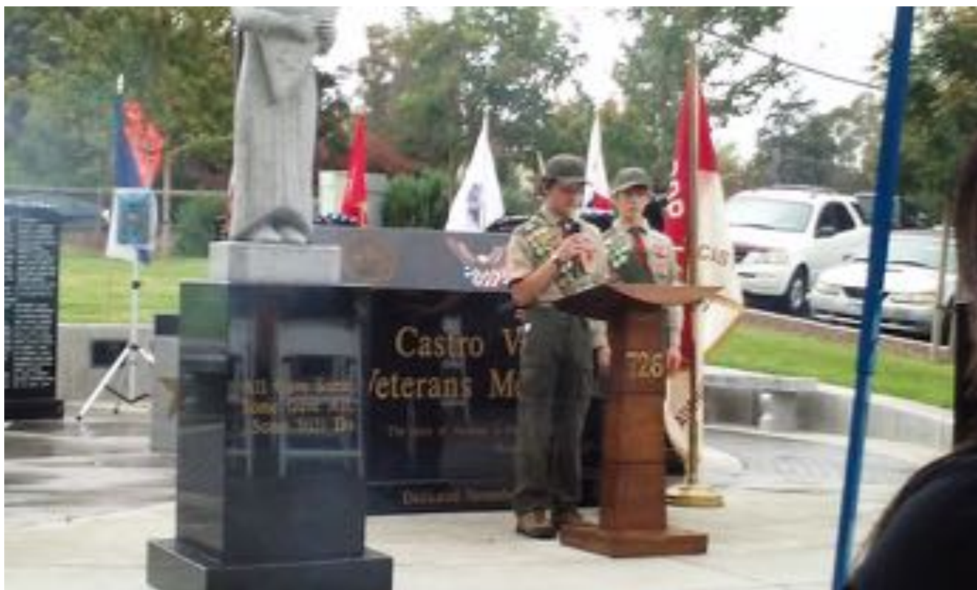
Senior Patrol leader of Troop 726 speaks