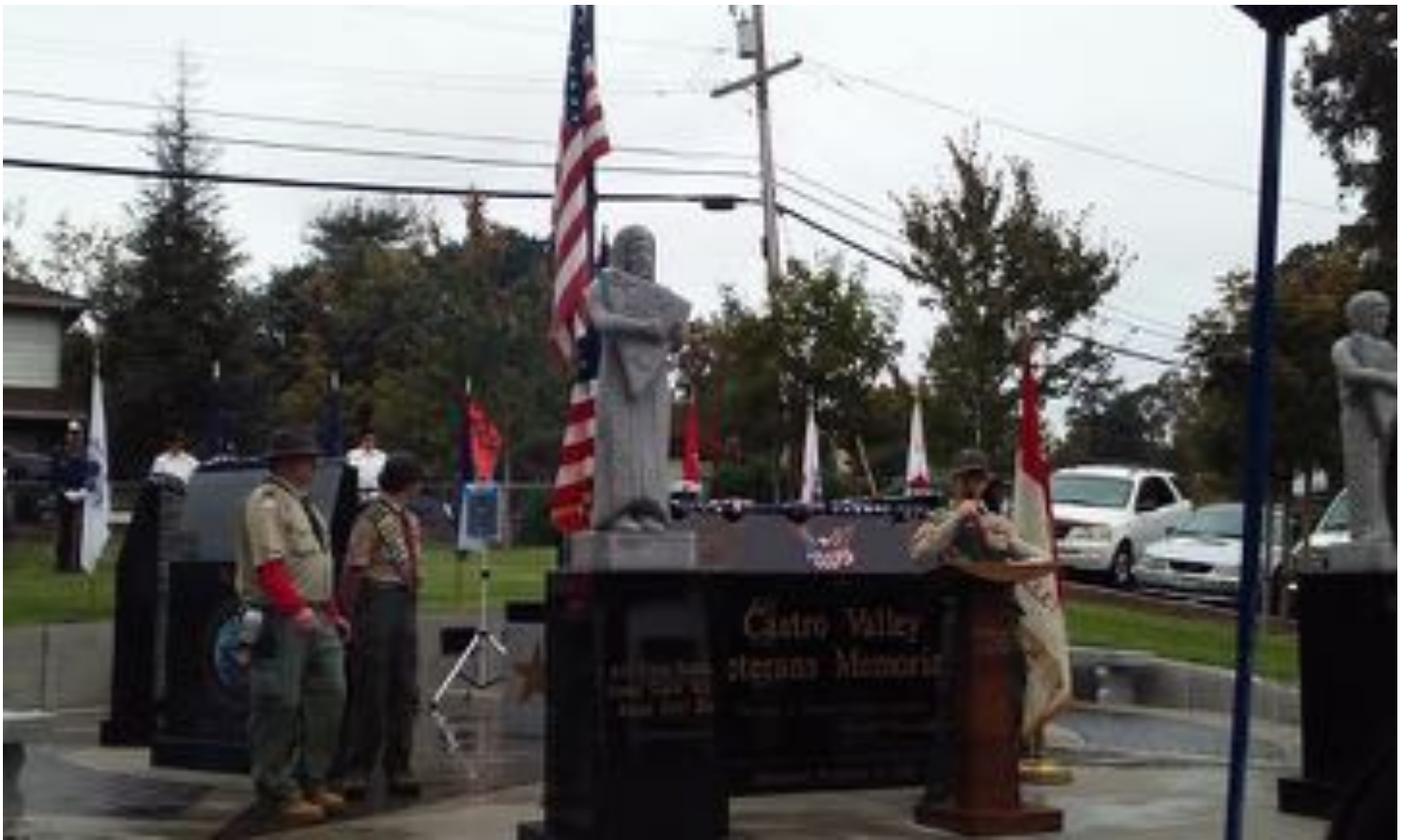
Master of Ceremony