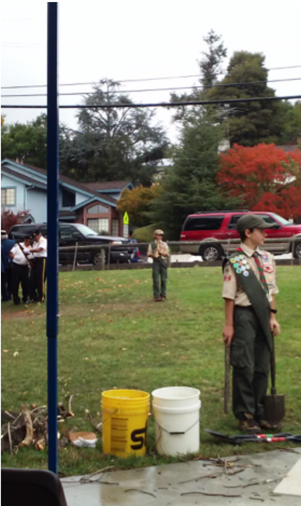
The flame is tended and we prepare for the bugle call.