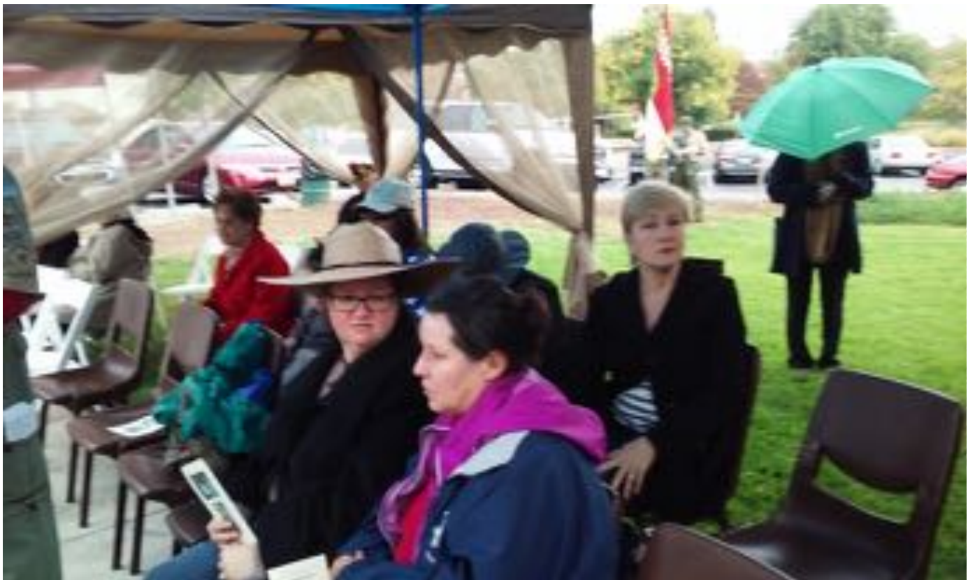
Many were remembering...