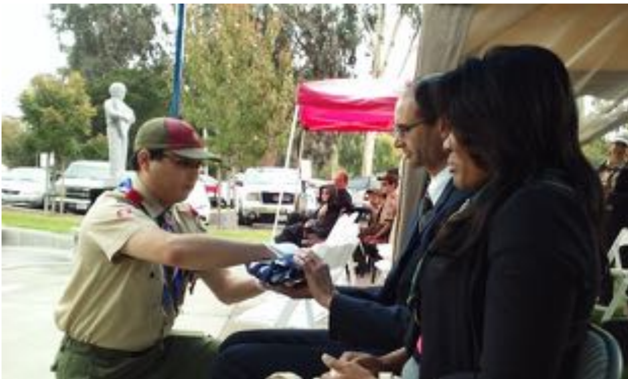
A US flag is presented to the guests of honor...