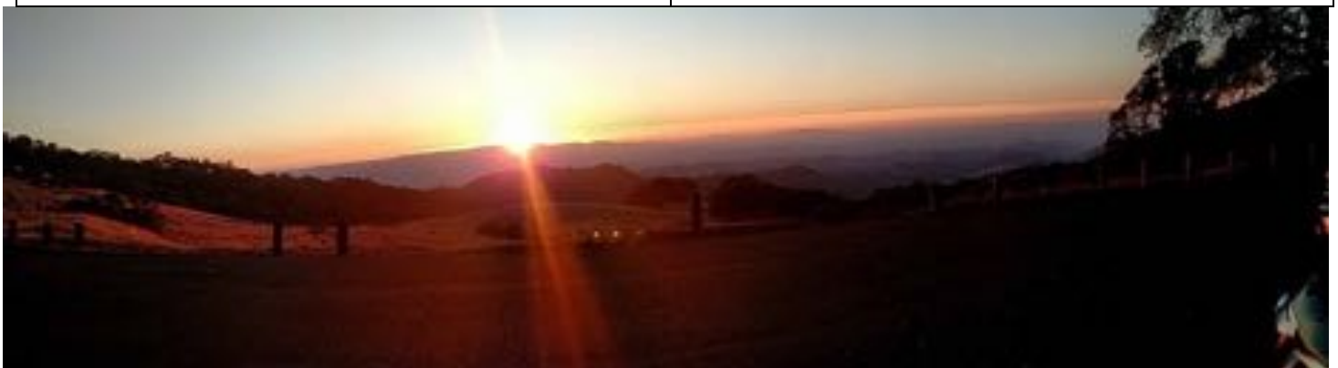
Photo from Geocaching at Mt Diablo November 2015