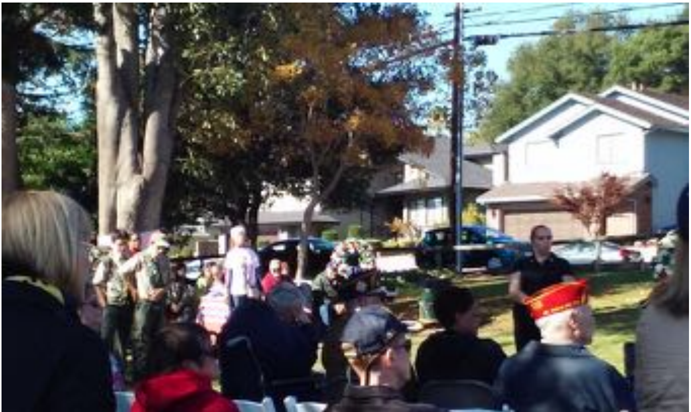
There was even a sign language interpreter