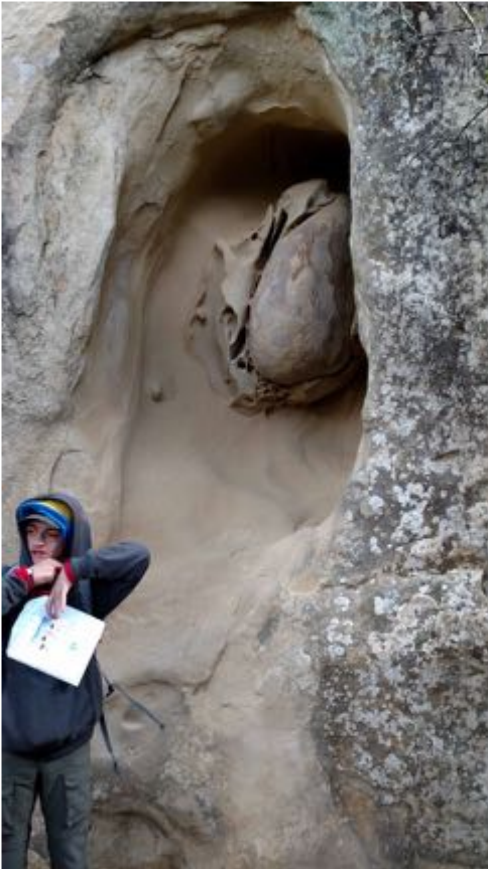
Our fearless Senior Patrol leader...always on duty!