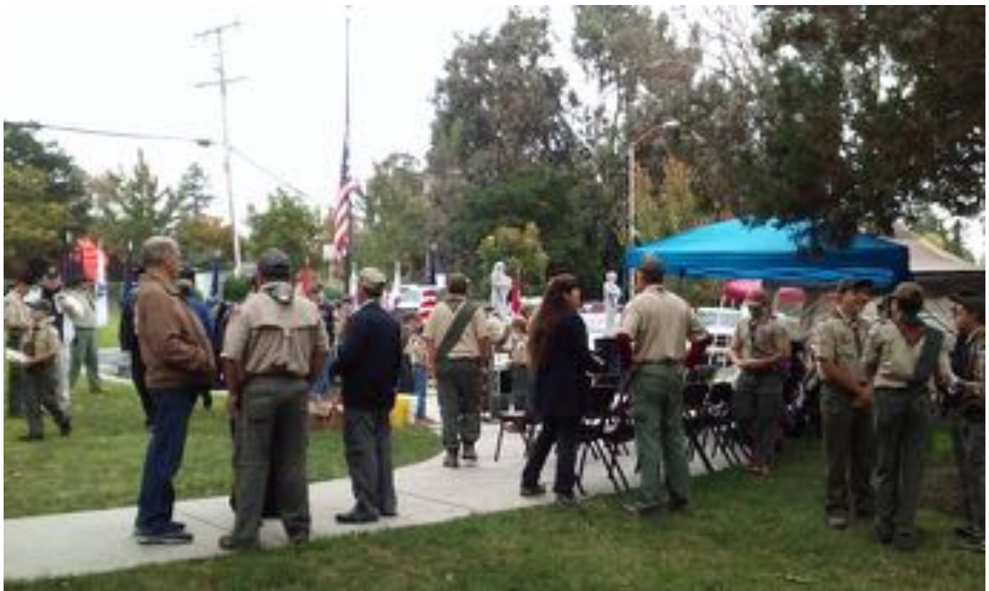
Before the ceremony...