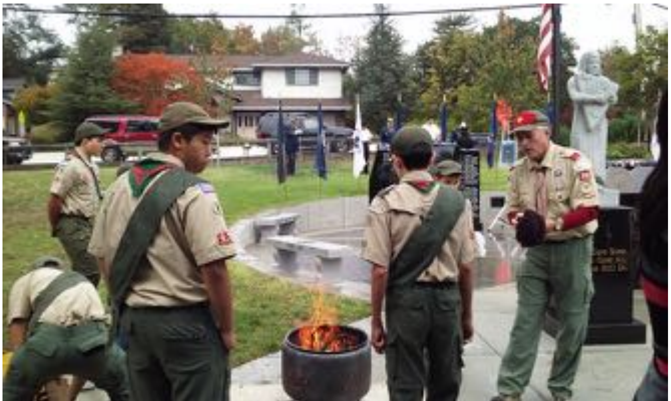
the Flame was lit