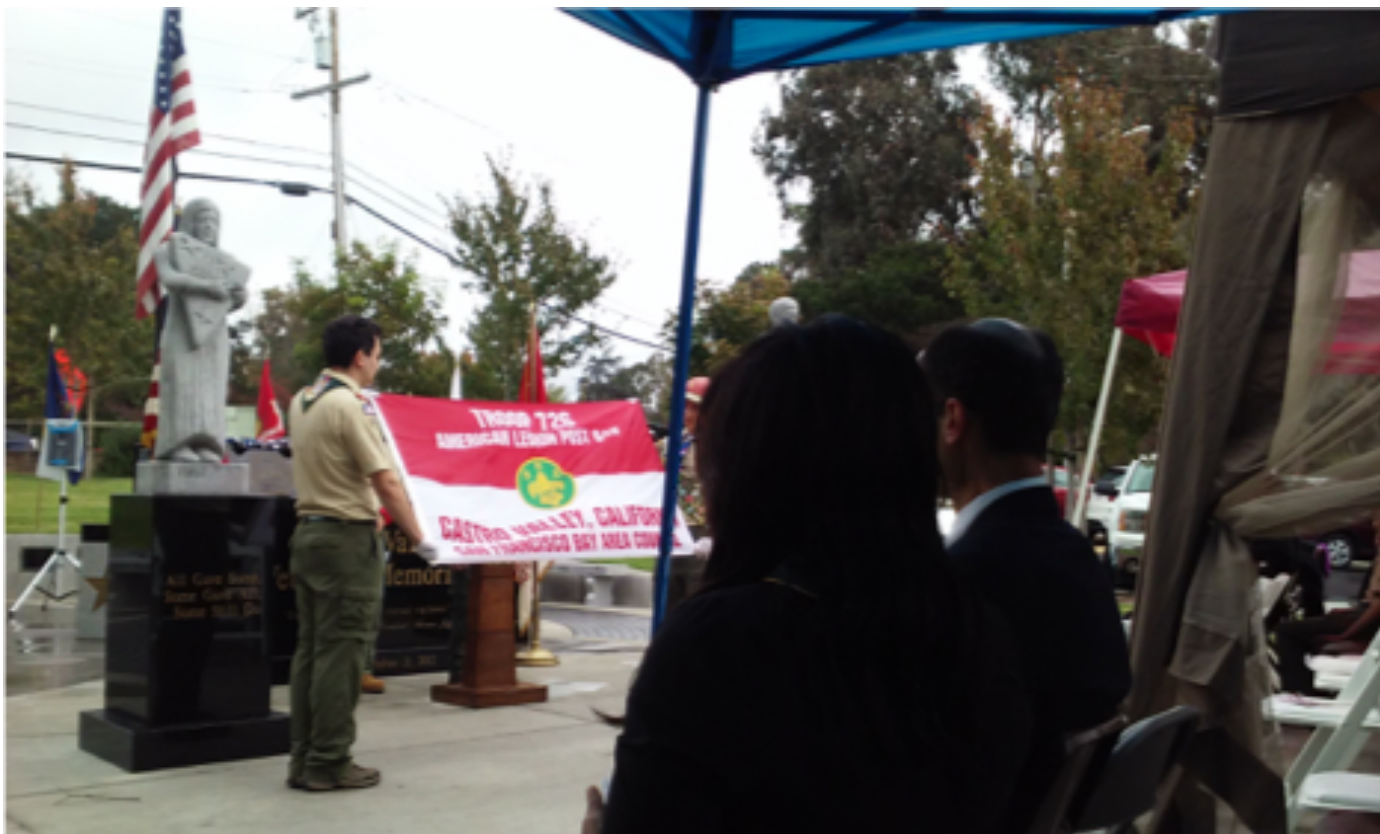
The guests of honor listen