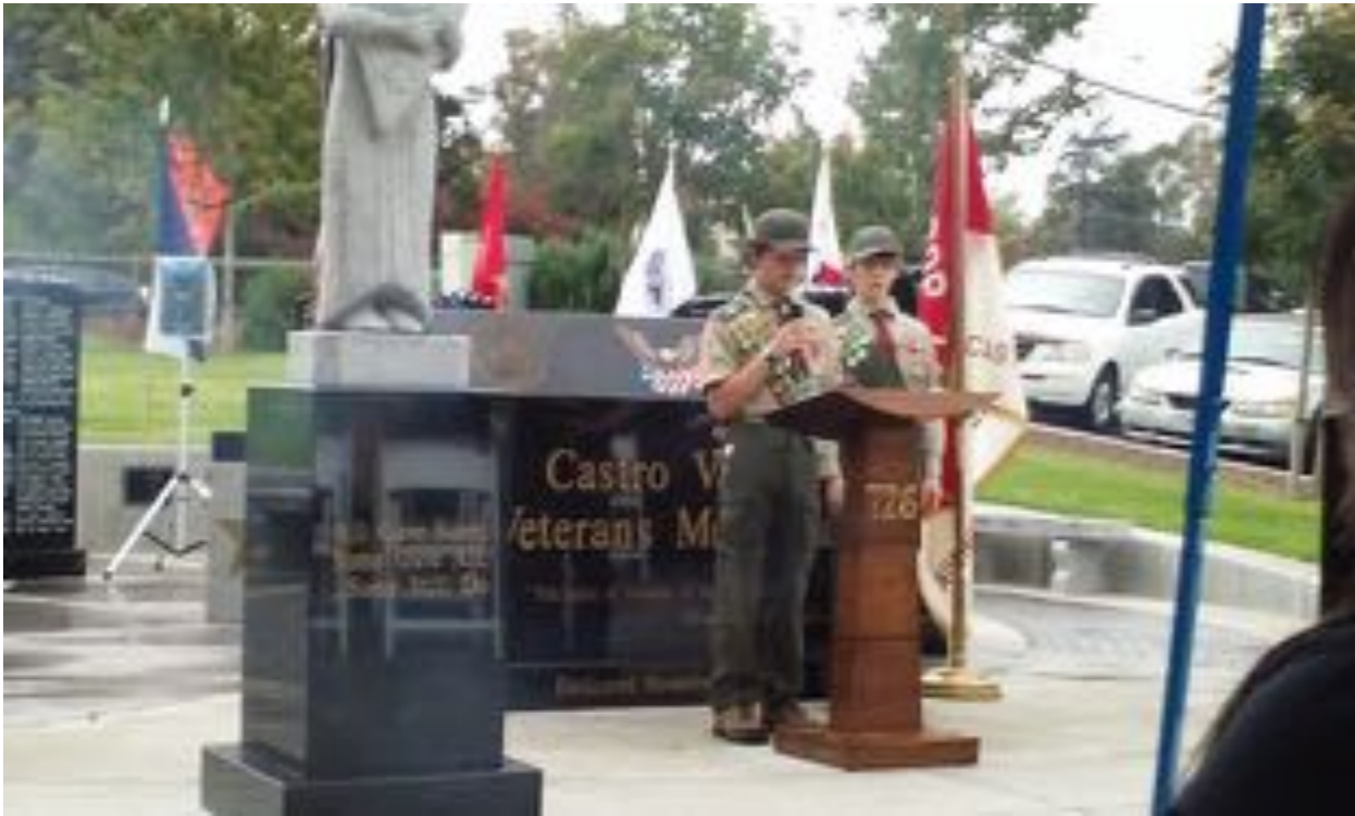
Our Senior Patrol leader speaks